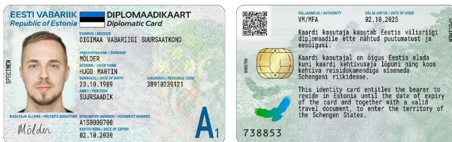
Caption 4 Specimen of the Diplomatic Card issued since 15.11.2025