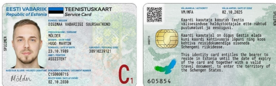
Caption 5 Specimen of the Service Card issued since 15.11.2025

A diplomatic identity card is issued free of charge and grants the document holder immunities and privileges outlined in the Vienna Convention on Diplomatic Relations [5] and other international conventions and treaties according to the relevant category. 09.03.2017 regulation no. 7 of the Minister of Foreign Affairs (MFA) [6] establishes the procedure for issuing a diplomatic identity card, the format and technical specification of the card, and the list of information entered on the card.