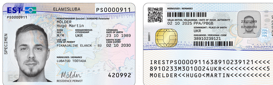
Caption 3 Specimen of the RP card issued since November 15, 2025